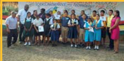
Above: Regional Science Fair winners