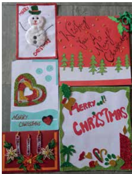
Christmas cards sent to the CGEF from Pakistan

The CGEF will sponsor girls regardless of their religious or cultural background, so it was lovely to receive such a heartfelt gift in return.