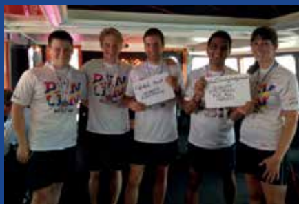
Team CGEF runners at the British 10K London Run